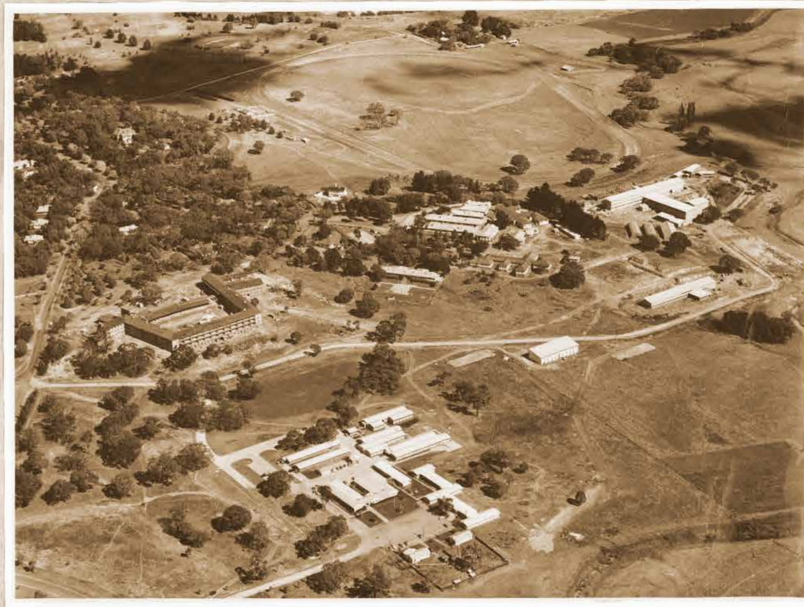
The Research School of Physical Sciences.