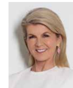
The Hon Julie Bishop Chancellor

As we work to bring our vision to life, our values will guide and inform us, and we will continue to deliver on the mission set for ANU in 1946: “bring credit to Australia, advance the cause of learning and research in general, and take its rightful place among the great universities of the world.”