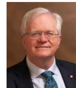
Professor Brian P. Schmidt AC FAA FRS Vice-Chancellor and President