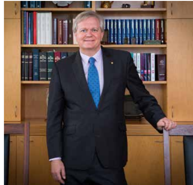
Professor Brian P. Schmidt AC FAA FRS