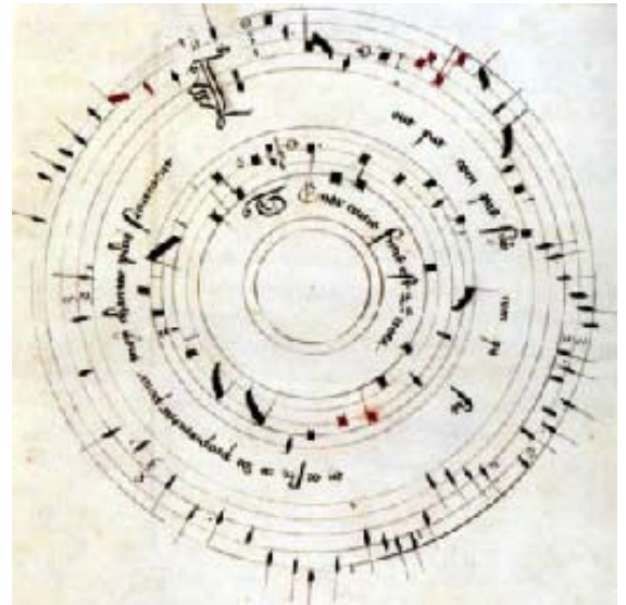
Tout Par Compas by Baude Cordier (c.1380-c.1440) Top image: The New Complexity by Brian Ferneyhough

Inquiries: Email: administration.rsh@anu.edu.au . Phone: 6125 2700