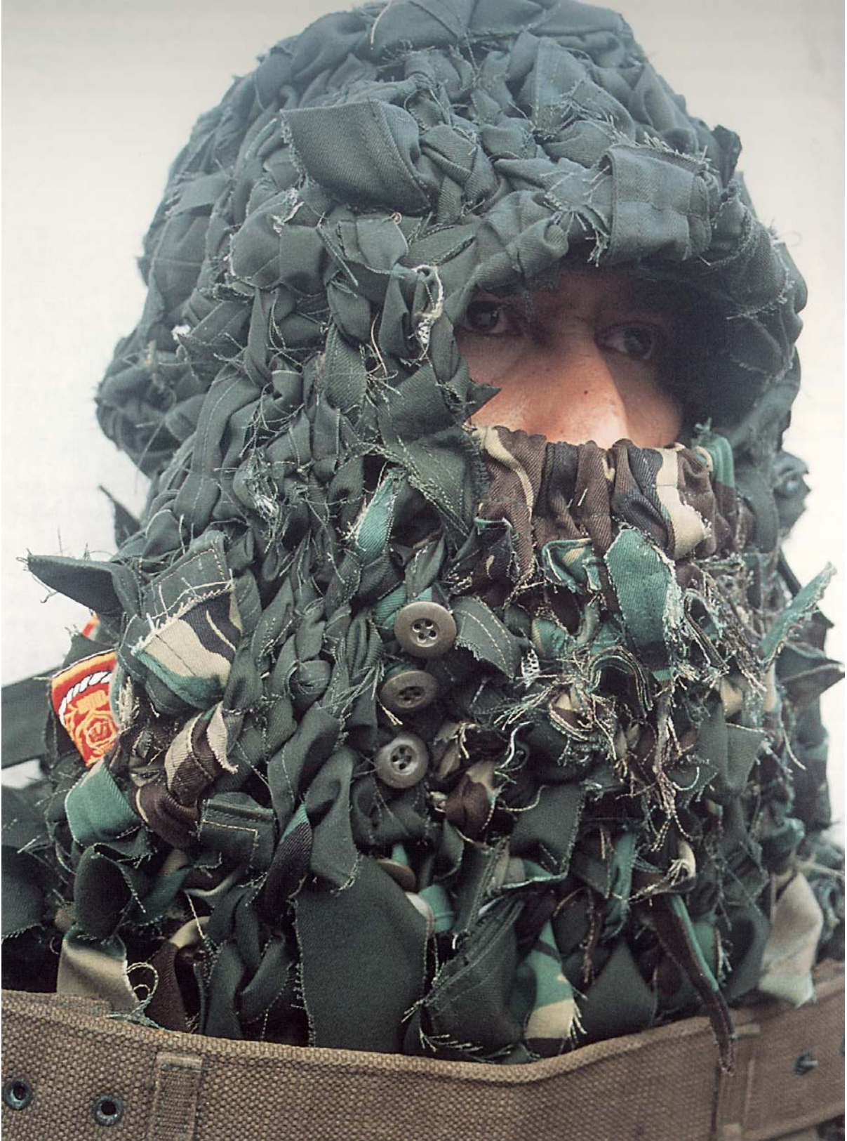
Mella Jaarsma, The warrior , 2003 (detail), used military clothes and seaweed.