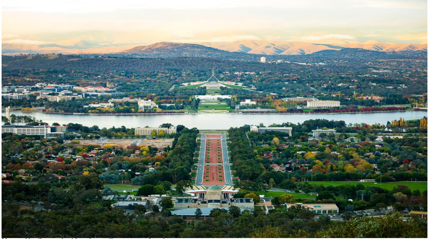
Mount Ainslie overlooking the parliamentary triangle, Courtesy Australian Traveller website