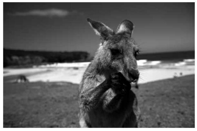
Kangaroo, Pebbly Beach, Murramarang National Park

visitcanberra.com.au/en/Canberra-and-surrounds.aspx