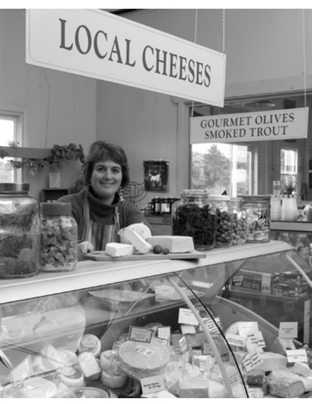
Robertson Cheese Factory, Southern Highlands