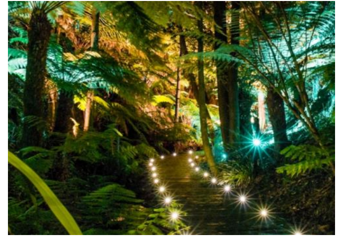
Australian National Botanic Gardens