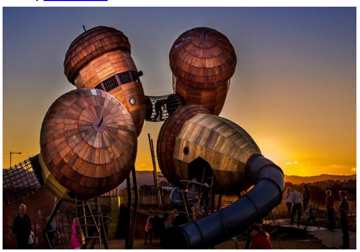
Pod Playground at dusk, National Arboretum Canberra