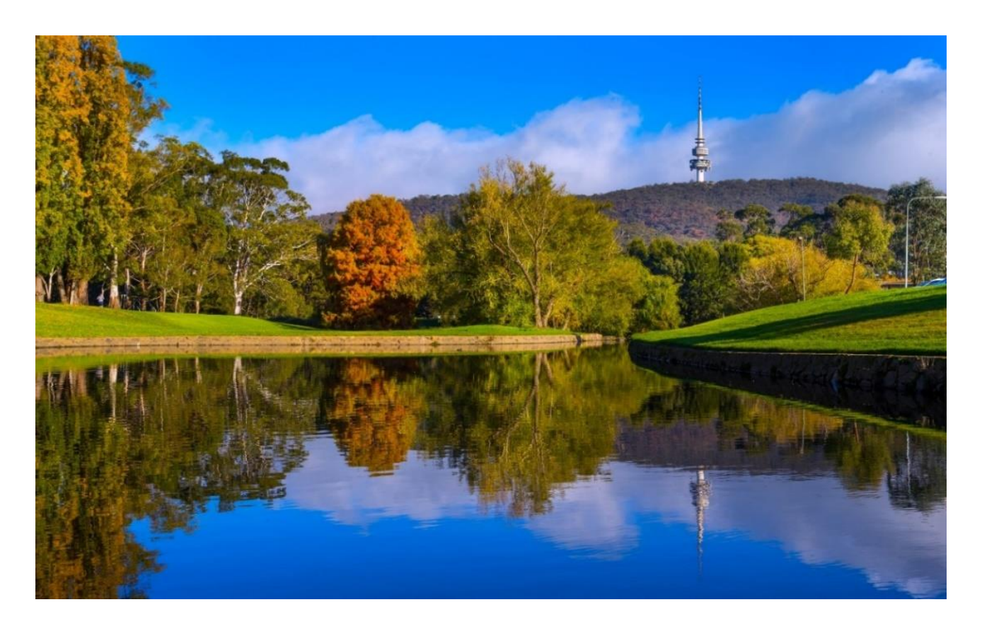
ANU Campus Image courtesy ANU Flickr Image Library