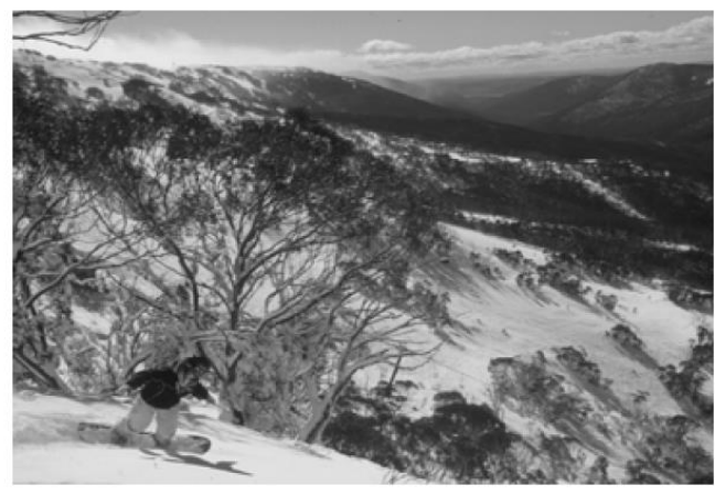
Snowboarding, Thredbo, Snowy Mountains