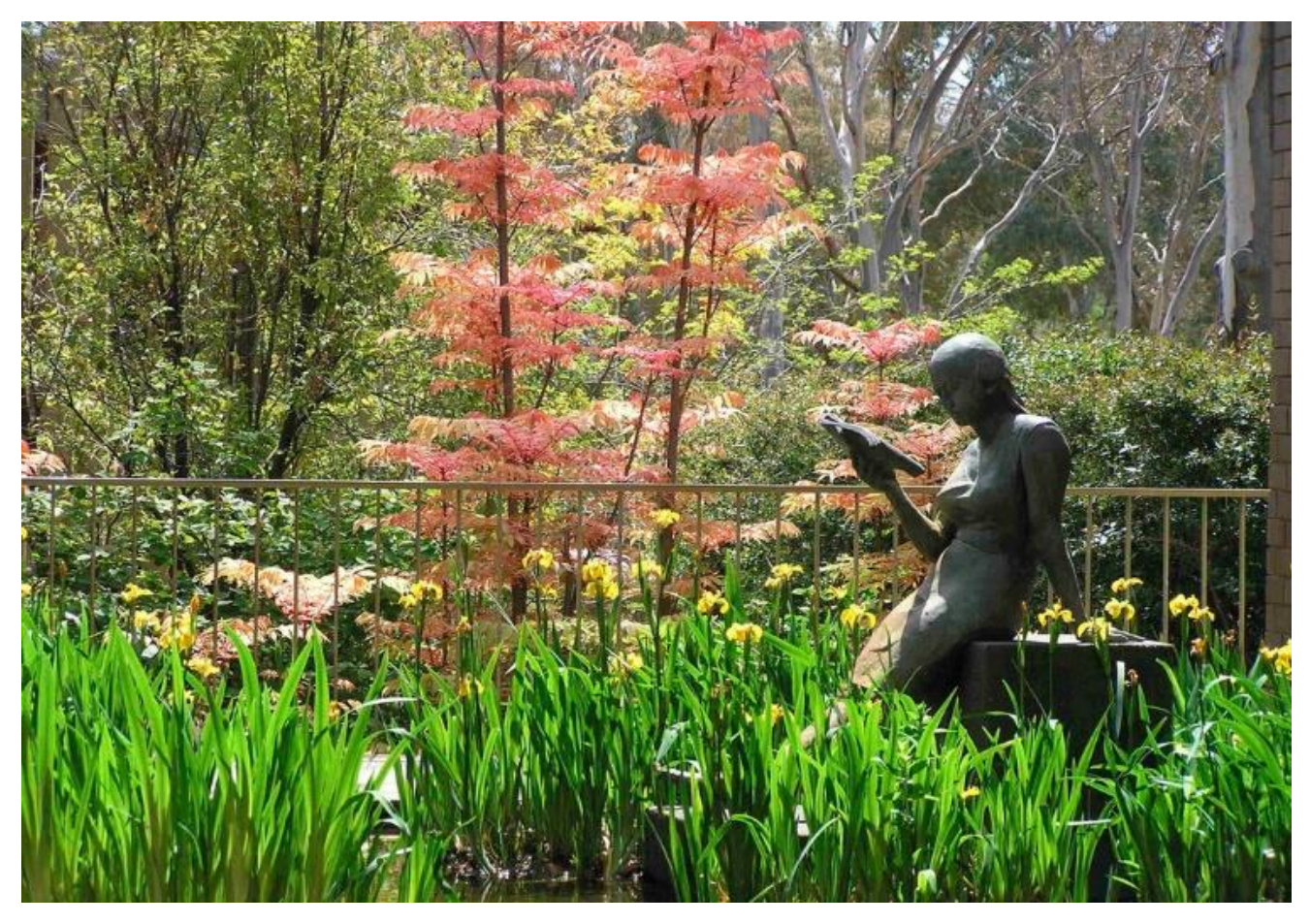
Saraswati 1969 (in pool near entrance of Chancelry), Bronze, gift of the Indonesian government 1969