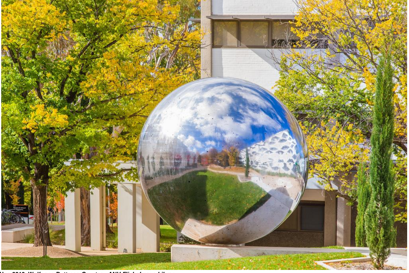
Una 2013, Wolfgang Buttress