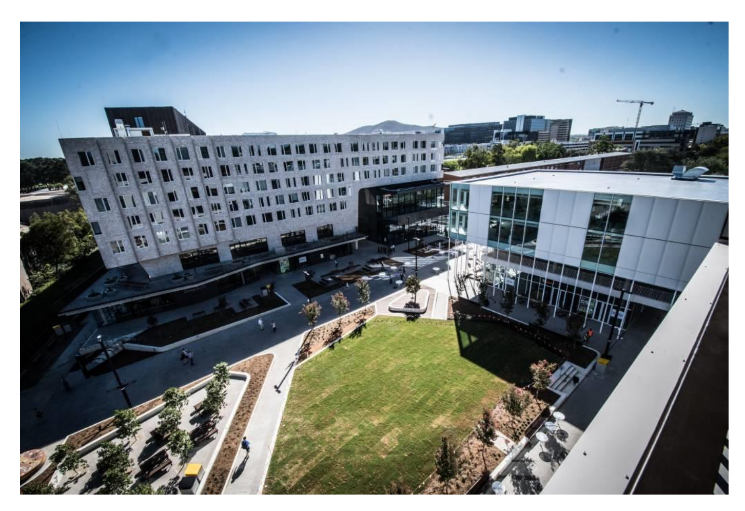
ANU Kambri Precinct