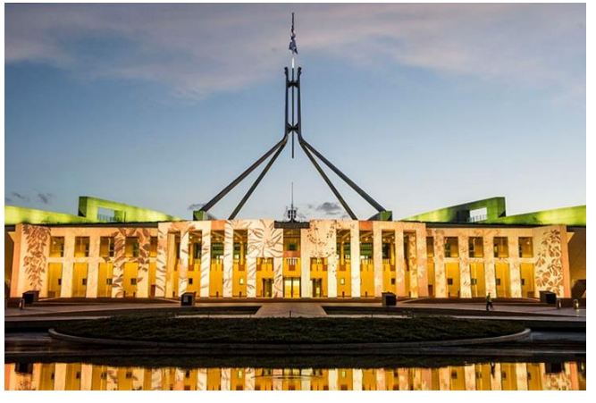
Parliament House during the Enlighten Festival, Courtesy Parliament of Australia photo gallery