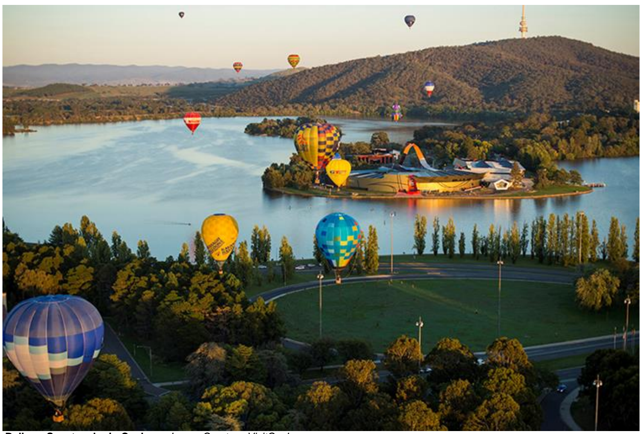
Balloon Spectacular in Canberra

You will also need to consider other significant education expenses such as textbooks, supplies, a personal computer, and the cost of fieldwork, if required in your program.